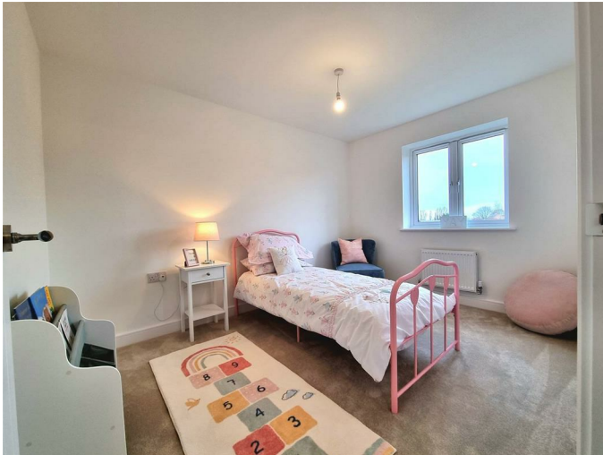
Bedroom Three 8'9" x 11'8" (2.69m x 3.58m)

Double Glazed Windows. White Emulsion to Ceilings and Walls. White Satin Skirting and doors. Chrome Door handles. Electric points. Television Point.