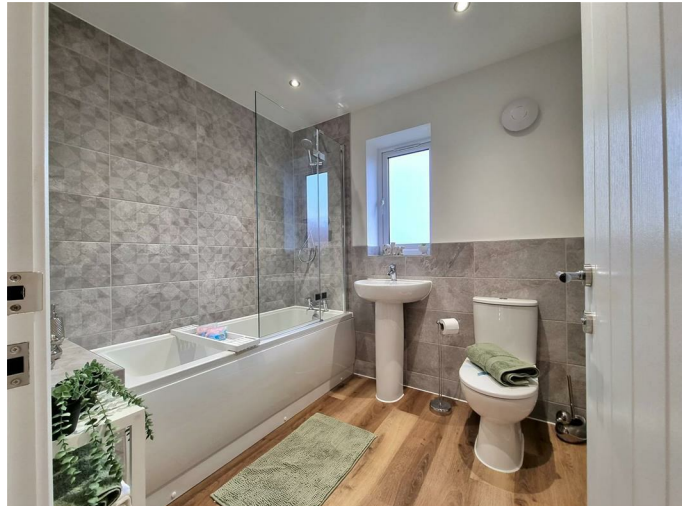
Bathroom 7'8" x 6'9" (2.35m x 2.06m)

Fitted White Sanitaryware. Extractor Fan. Shaver Point. Chrome Heated Towel Rail. Tiling around bath. LVT Flooring.