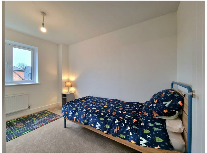
Bedroom Four 8'10" (max) m x 11'8" (2.71 (max) m x 3.58m)

Double Glazed Windows. White Emulsion to Ceilings and Walls. White Satin Skirting and doors. Chrome Door handles. Electric points. Television Point.