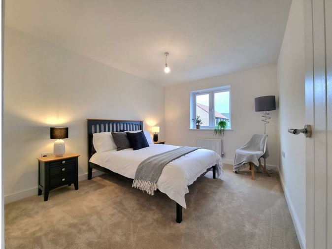
Bedroom Two 10'0" x 12'5" (3.07m x 3.81m)

Double Glazed Windows. White Emulsion to Ceilings and Walls. White Satin Skirting and doors. Chrome Door handles. Electric points. Television Point.